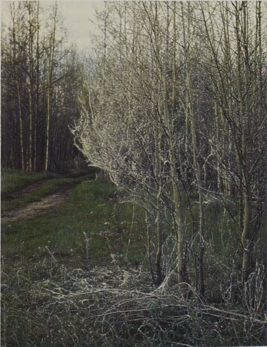
Figure 2. Extreme aspen defoliation. Note the conspicuous webbing.

two or more years of heavy infestation. This often occurs in areas of new building or road construction where trees are mechanically damaged and soil is compacted or excessive amounts of soil are placed on the root system.